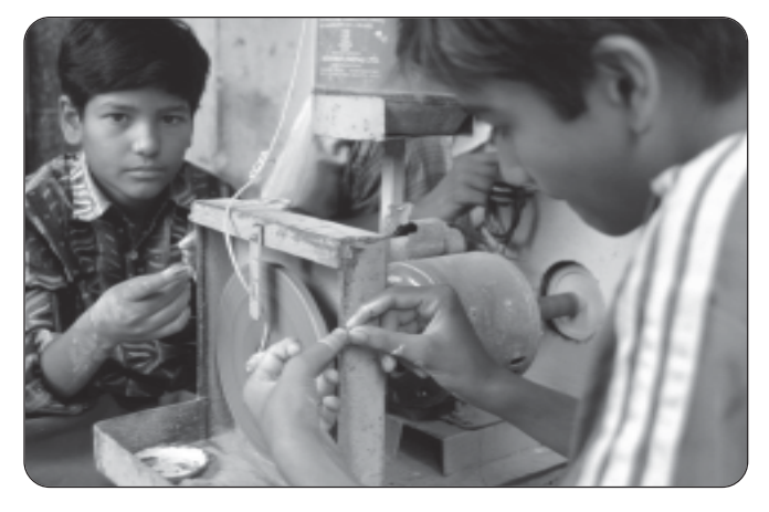
ers' rights to organize unions and collectively bargain.

The International Confederation of Free Trade Unions continues to propose adding a "social clause" covering seven core labor standards, including prohibitions on child labor, to WTO rules governing international trade. This proposal has so far been rejected by WTO leaders. Trade agreements between the U.S. and Cambodia have successfully included incentives for garment manufacturers to improve factory working conditions. Agreements require factory owners to respect core labor standards, including eliminating child labor and respecting work-