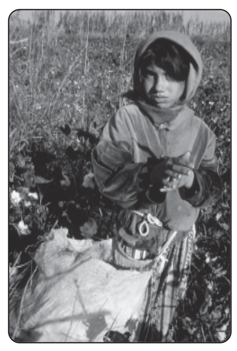
Girl picking cotton.