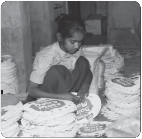
Girl packaging Nestle products.