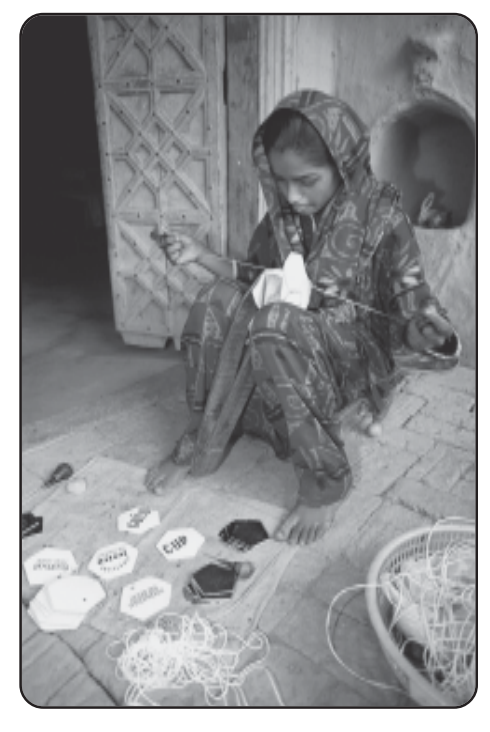
Girl sewing footballs at home.

In 2002, as news of child labor abuses and attacks on workers in Ecuador's banana plantations spread around the world, workers, consumers, and students contacted Los Alamos plantation owner Alvaro Noboa to demand that