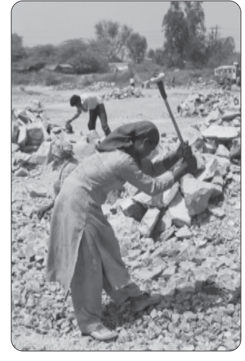
Breaking stones.