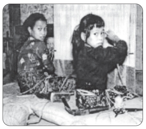
Girls at work hand-tying knots at a carpet loom.